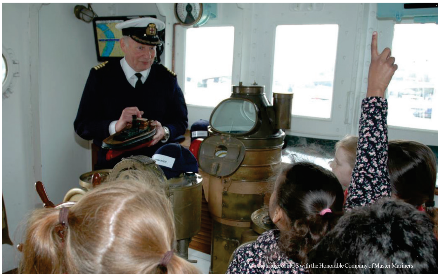
On the bridge of HQS with the Honorable Company of Master Mariners

As part of its 700th anniversary celebrations in 2008, an appeal amongst members has allowed the Company to support the Outreach Work for the Extended Medical Degree Programme at King's College London School of Medicine. This programme seeks to encourage students from maintained schools in London and the surrounding