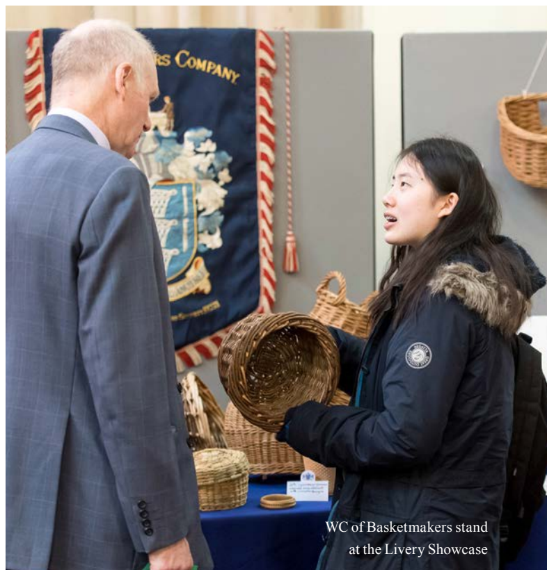
WC of Basketmakers stand at the Livery Showcase

Many young butchers are in need of advanced butchery training to improve their skills. To encourage this, the Company has sponsored visits by groups of young butchers to the world-class Meat Trade College in Roskilde, Denmark, where they have undertaken advanced butchery training. The visits are organised in conjunction with the Institute of Meat who have reported back on how enthusiastic the