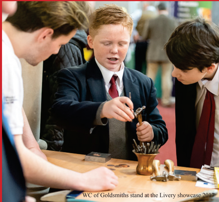
WC of Goldsmiths stand at the Livery showcase 2017

The Livery, developing support for education, helping to prepare young people for the future.