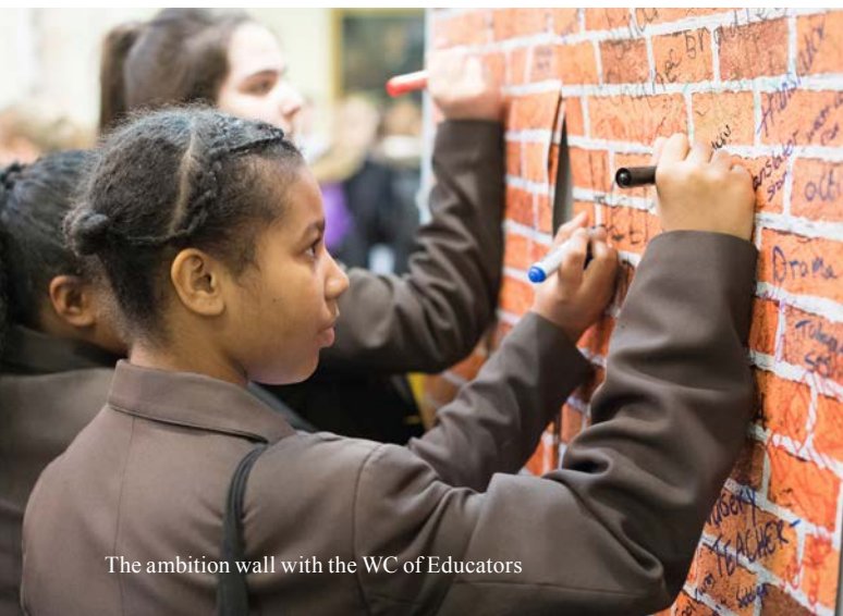
The ambition wall with the WC of Educators

Together with Livery Schools Link and the Worshipful Company of Actuaries we are closely involved in the organisation of the conferences to bring together school Head teachers and Livery Companies.