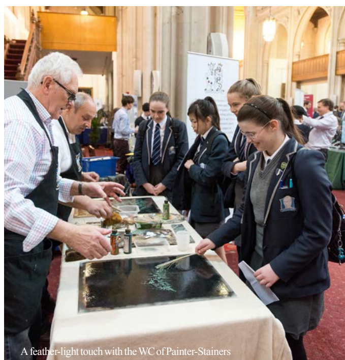
A feather-light touch with the WC of Painter-Stainers

The Painter-Stainers' Company fulfils its objects in support of the education of fine and decorative artists in three ways. It awards school prizes to budding artists in schools around the country and it also awards "Painters' Scholarships" of £5,000 per annum to 2nd year undergraduates at the Slade School of Fine Art, the City & Guilds of London Art School, Chelsea College of Arts and Wimbledon College to support the completion of their degree courses. Lastly it is a co-founder with the Lynn Foundation of the Lynn Painter-Stainers' Art Prize, which was established in 2005 to encourage representational painting in Britain and provide young artists in particular the opportunity to have their work selected and hung alongside more established artists in an annual exhibition in a central London gallery. Full details of this open competition, which annually makes 4 awards totalling £25,000, and those pictures shortlisted for the exhibition over the last twelve years, can be found at www.lynnpainterstainersprize.org.uk