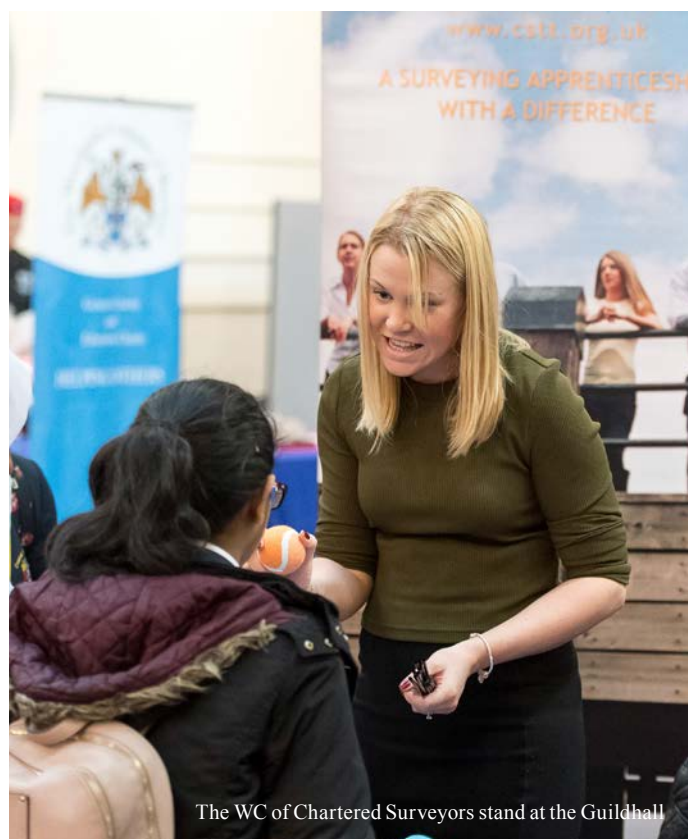
The WC of Chartered Surveyors stand at the Guildhall

The Company is a significant benefactor of the Chartered Surveyors' Training Trust which was set up in 1984 to offer college places coupled with work experience to young people who wished to enter the property profession but who could not do so by the traditional route of Higher Education. The CSTT now offers apprenticeships to young people wishing to enter the property profession.