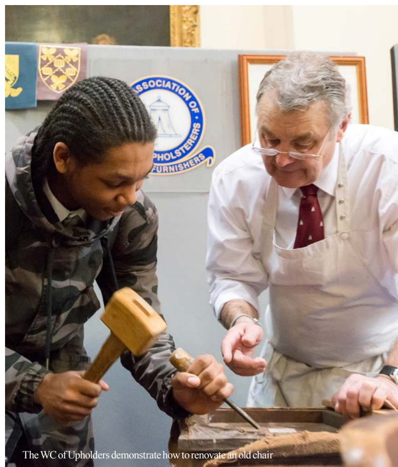
The WC of Upholders demonstrate how to renovate an old chair

The Society has sponsored prizes in the past for students at the City of London Freeman's School and the City of London Girls School. The court are reviewing all prize awards and exploring opportunities for the future. This may include the possibility that in the future, a small number of students from one of the City of London Academy sponsored schools could accompany us on our Lord Mayor's Show float which we have each year. A future research project is being planned. We seek to encourage volunteering, mentoring and charitable giving.