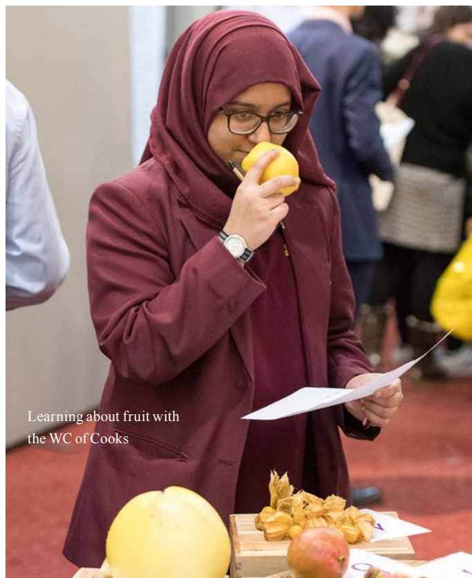
Learning about fruit with the WC of Cooks

We are looking to expand our own apprentice scheme in conjunction with Westminster Kingsway College.