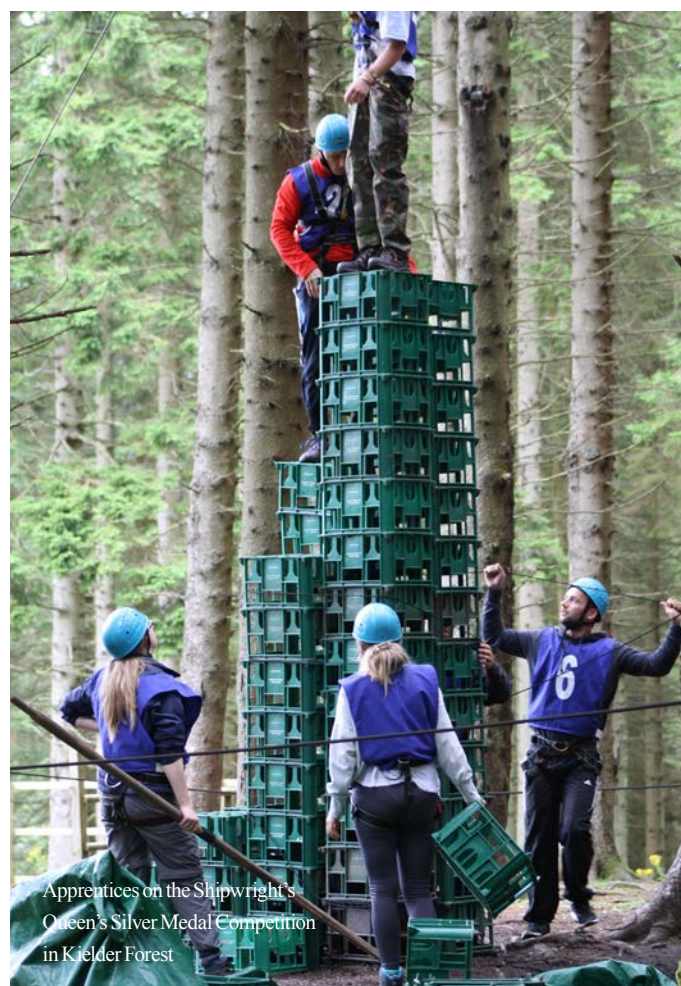
Apprentices on the Shipwrights' Queen's Silver Medal Competition in Kielder Forest

The Shipwrights' Company has continued its long tradition of promoting and supporting education in the City and nationally in a variety of ways and remains committed to contributing and