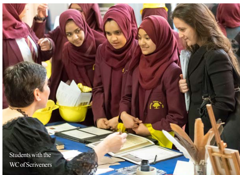
Students with the WC of Scriveners

The Scriveners' Company supports education through the provision of bursaries and/or other financial support to the City of London School