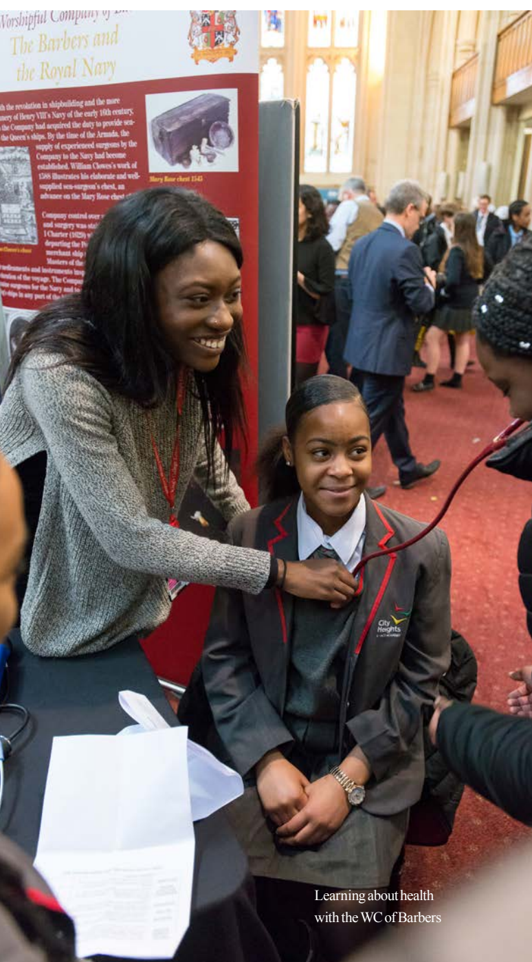
Learning about health with the WC of Barbers

The Worshipful Company of Brewers is the trustee of two major foundations and a number of smaller charities that support Aldenham School in Elstree, Hertfordshire and Dame Alice Owen's School in Potters Bar, Hertfordshire, as well as educational projects in Islington. The grants from the foundations support both capital and revenue projects. There are also grants available for students at the school, alumni and staff. The Brewers' Company, who provide governors to the two schools, also present prizes, award beer money and deliver lectures on brewing and routes into the brewing industry to both of their schools.