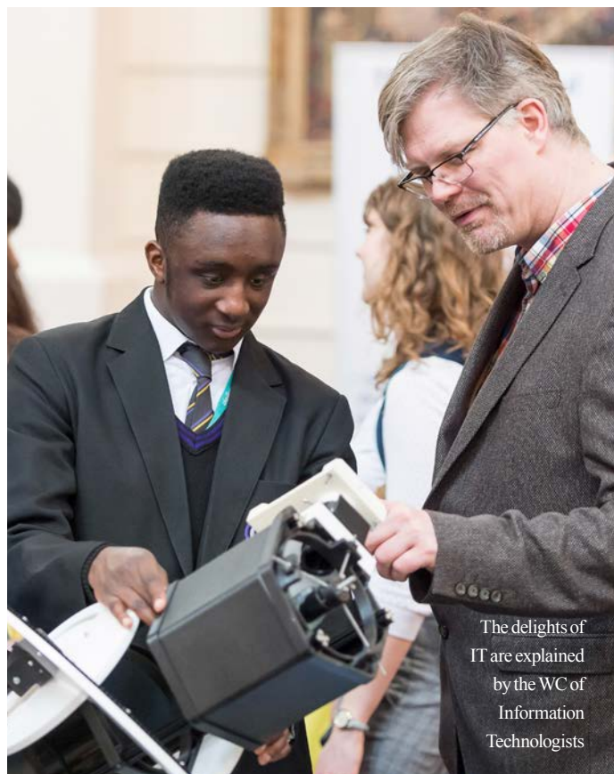
The delights of IT are explained by the WC of Information Technologists

Our focus is Information Technology (IT) in its broadest sense which means encouraging more students into Science, Technology, Engineering and Mathematics studies/careers and generally increasing the awareness and competent use of IT across the whole student population. Additionally we are much involved in influencing curricula to ensure that UK educational establishments are providing the right IT/Computing skills to industry to improve the global competitiveness of the UK.